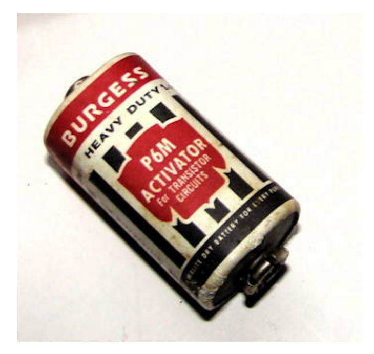
Figure 3: The NEDA 1600D (Burgess P6M) battery believed to be supplied with the early HD-20 kits. A round NEDA 1600 (Burgess P6) fits as well.

The HD-20 uses a 9V battery, (see Figure 3 ), common at the time, that is no longer easily obtainable, NEDA # 1600. Heath supplied a Burgess battery<sup>3</sup> (Heath P/N 418-6) as part of the <u>early</u> kits. Table I lists equivalent batteries from various companies of the period. By late 1962 the battery was no longer included